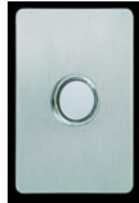
Figure 2 Hall Call Station

Hall Call Stations are installed at all landings to move the cab to the landing from which it is being called. An optional key switch limits the elevator's use to authorized persons only.