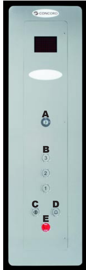
Figure 1 3 Stop COP Panel

The button can be set to Stop at any time to stop the cab and activate the alarm buzzer.